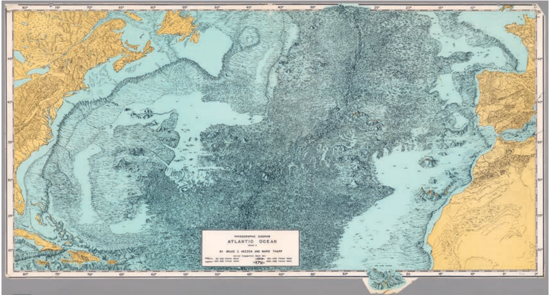
Physiographic Diagram of the North Atlantic, Marie Tharp and Bruce C. Heezen, 1957.

It must have been frustrating for an explorer with such tenacity to be so soundly defeated at measuring the depth of the ocean. Sailing west across the Pacific in 1521, on a voyage that would eventually circumnavigate the globe—and prove indelibly the spherical shape of the earth—Ferdinand Magellan lowered a weighted line to measure the fathoms below. 1 When the line dropped 750 meters without contact, he ordered it pulled up, declaring the ocean immeasurable. It was utterly apparent his tools were no match for the ocean's scale and vastness, its impenetrable watery territory. As technology has advanced into the twenty-first century, scientists and ocean explorers have continued to develop new and better methods to measure these depths—from longer weighted lines to echo and sonar, to satellite imagery and submersibles outfitted with GPS. But although humanity has now compiled vast amounts of data into maps, diagrams, and digital models, the full scope of the ocean—the hydraulic, topographic, geologic, and biological systems that comprise more than 70 percent of the Earth's surface—have yet to be fully comprehended.