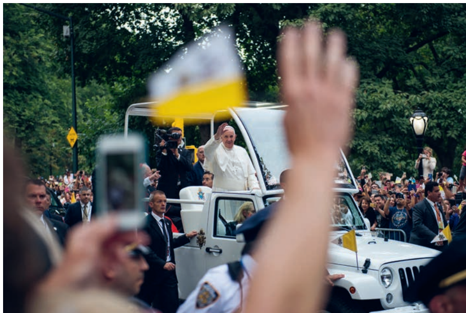
Pope Francis's motorcade in Central Park, September 25, 2015.

few months before his wildly popular September visit to the United States. Cruising the streets and avenues of New York City in his little black Fiat Cinqecento, he was a fascinating sight. That white-robed arm waving at us from the open window of the backseat, in contrast to the flashing red lights of the New York City Police Department's escort, spoke volumes. The choice of Central Park as the site for Francis's Friday papal motorcade was a brilliant one, evoking the elastic power of Olmsted and Vaux's Greensward Plan to provide a graft of the natural world as the setting for this twenty-first-century version of the 1960s "Be-In." Too bad for Francis that his view of the tree canopy's biomass was seen through a plastic-bubbled Popemobile, though he didn't appear to mind. Even the massive traffic disruptions didn't seem so bothersome to typically grumpy New Yorkers. Need to get around with the Pope in town? We just walked—it took longer, but it's better for the environment anyway, and the weather was great.