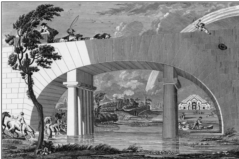
A View of Life in Freedomland, 2016. By the author after Vue Perspective, Lavoir et École rurale de Meilland , 1804, Claude-Nicolas Ledoux.