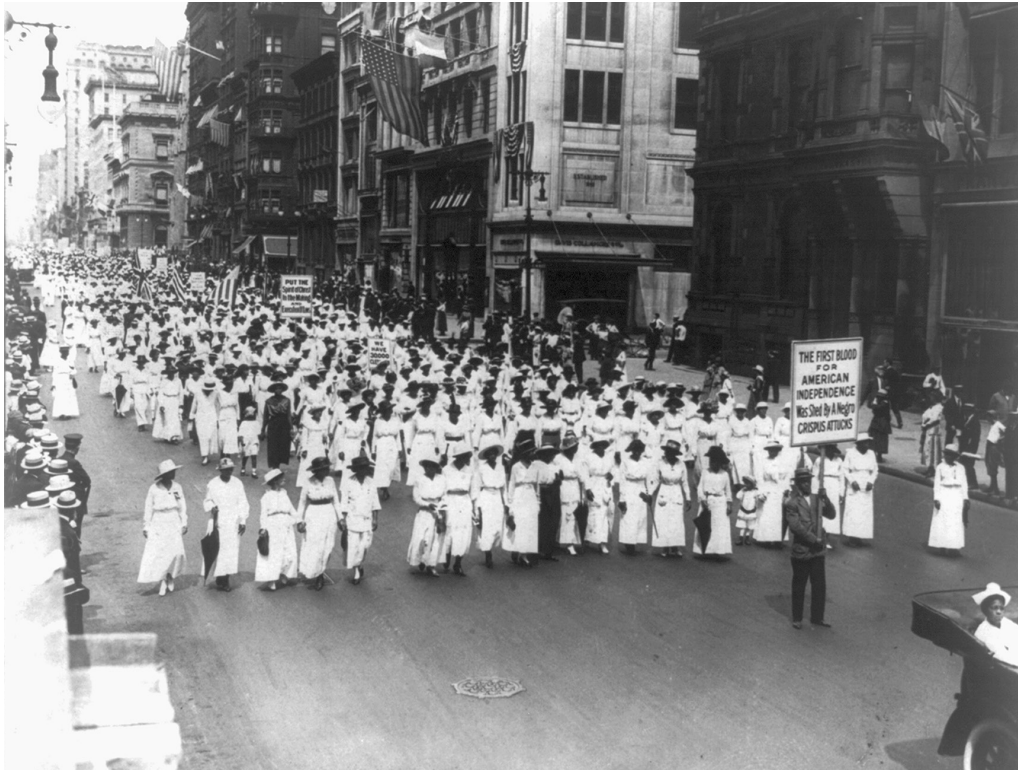
Silent protest of African-Americans in New York City, 1917.