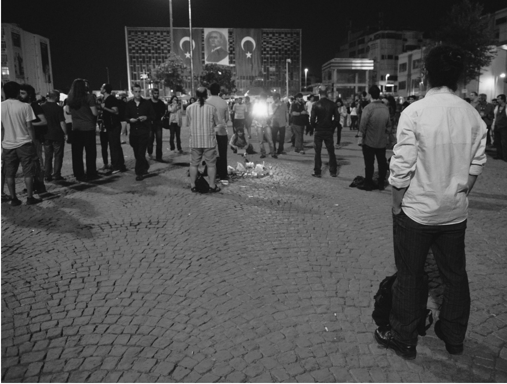
Erdem Gunduz, known as the “standing man,” in Istanbul’s Taksim Square, 2013.