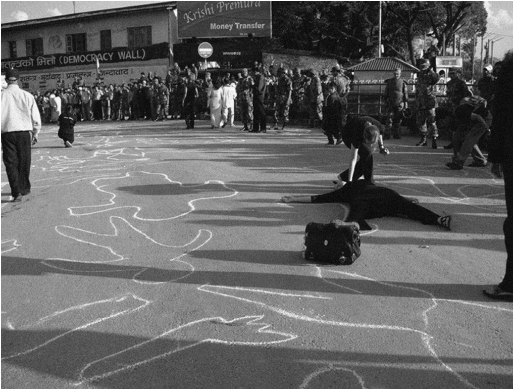
Chalk bodies. Courtesy of Ashmina Ranjit.