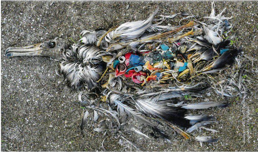
Albatross on the Midway Atoll, North Pacific. From Are We Human?

statement that “good design is an ethic rather than an aesthetic.” [4] This playful reappropriation indicates the authors’ view that a central social aim of modern design is to remove physical and psychological friction. As examples, they cite contemporary inaction in the face of the giant shelf of ice that slipped from Greenland in 2010 and the translation of human rights horrors into an aesthetic experience, as when drones capture the gazes of refugees looking up from vessels off the shore of Libya. More historical context here would be fascinating; one wishes they had addressed whether the aesthetization of the suffering of others correlates with Guy Debord’s “society of the spectacle,” say, or if the awestruck regard for the ice shelf relates to Edward Burke’s notions of the sublime.