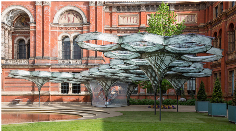
The Elytra Filament Pavilion at London's V&A museum was robotically fabricated through a filament-winding technique. The project was designed and constructed by a team of architects and engineers at the University of Stuttgart's Institute of Computational Design.