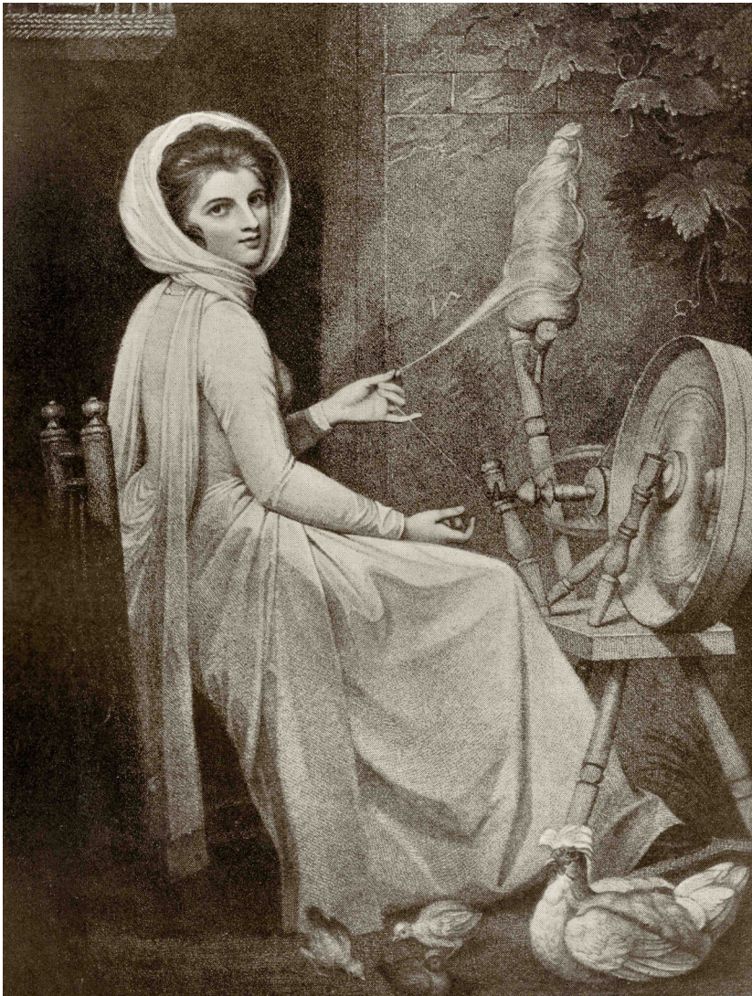
Engraving of Emma Lady Hamilton, 1761–1815, mistress of Lord Horatio Nelson, as “The Spinster.”