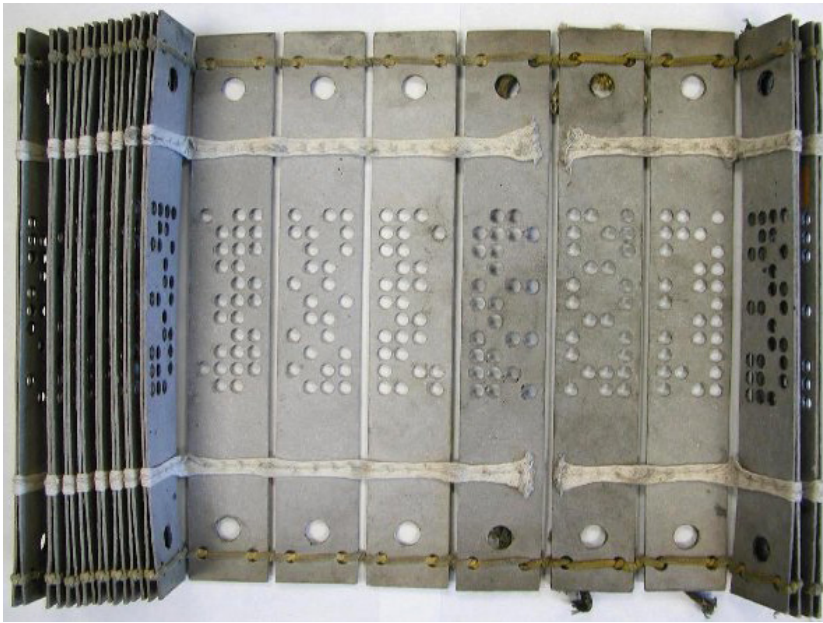
The binary principle embodied in the punched-card operation of the Jacquard loom was inspiration for the data processing machines to come, and the use of replaceable punched cards to control a sequence of operations marked an important step in the history of computing hardware.

punched cards controlled a sequence of weaving operations as the ability to alter a pattern correlated to changing cards: computation as physical labor. Serving as a conceptual precursor to the development of programming and data entry, the Analytical Engine drew from these logics.