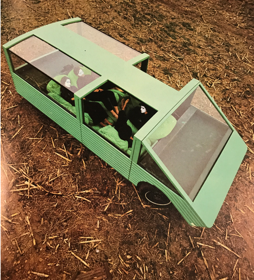
Mario Bellini's "Kar-A-Sutra," a mobile living environment realized for MoMA's Italy: The New Domestic Landscape , 1972.

Experimental architecture practices of the 1960s and '70s explored mobile living typologies with innovation and exuberance. Projects such as Archigram's Walking City (1964) or Mario Bellini's Kar-A-Sutra mobile living environment (1972) offered radical propositions of dwelling on the move, which rejected domestic assumptions and architectural conventions of the time. Despite this rich precedent, new caravans marketed to the middle class boast customization and personalization to mimic that of suburban mass-produced