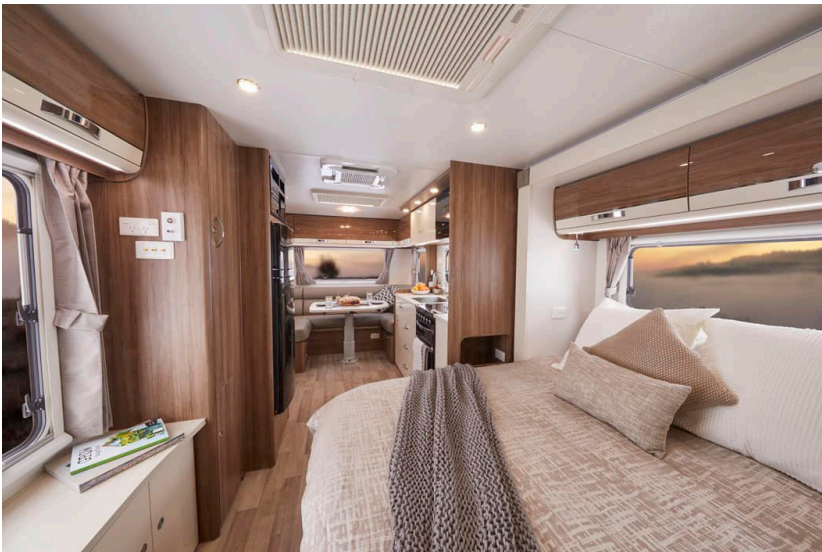
Interior view of the Jayco Silverline Caravan.