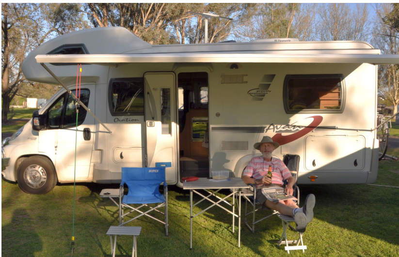
End of the day in Coonabarabran, New South Wales.

Gray nomads are a highly visible group, often to be seen towing their caravans or driving their motor homes, kombis, caravans, tour buses, and campervans along regional highways and coastal roads, always on the move and rarely staying in a single spot for more than a few weeks. Between these