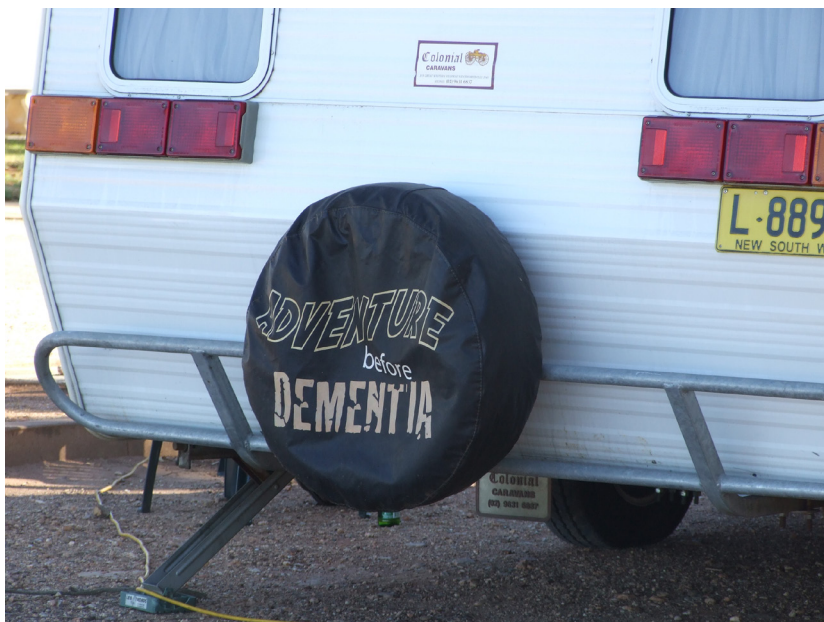
Gray nomads, Peterborough, South Australia.