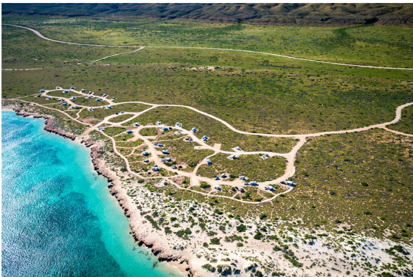
Aerial view of Osprey Campground.