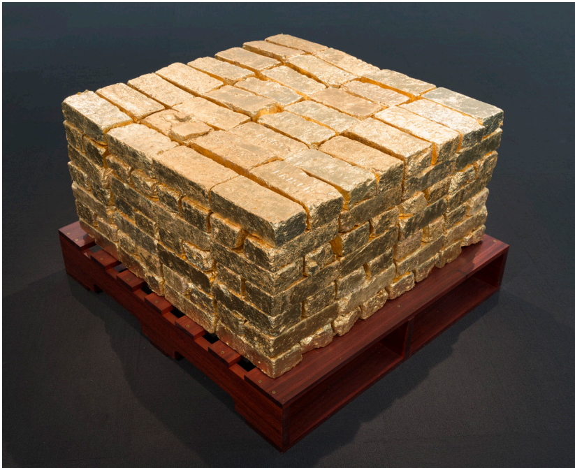
Amanda Williams, It's a Gold Mine/Is the Gold Mine? , imitation gold leaf on salvaged Chicago brick, 2016.

equally valuable, with the salvaged brick reduced to the same level of meaning as the new drywall.