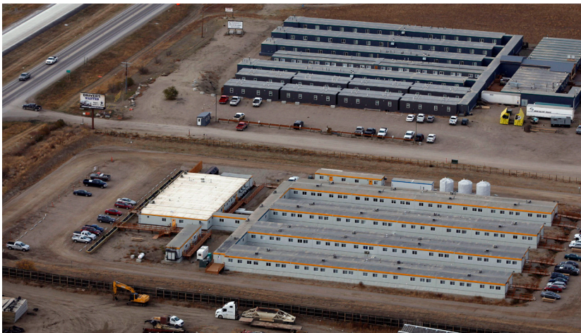
A man camp for oil field workers outside Williston, ND, October 19, 2012. Thousands of people have flooded into the state to work in the state’s oil drilling boom.