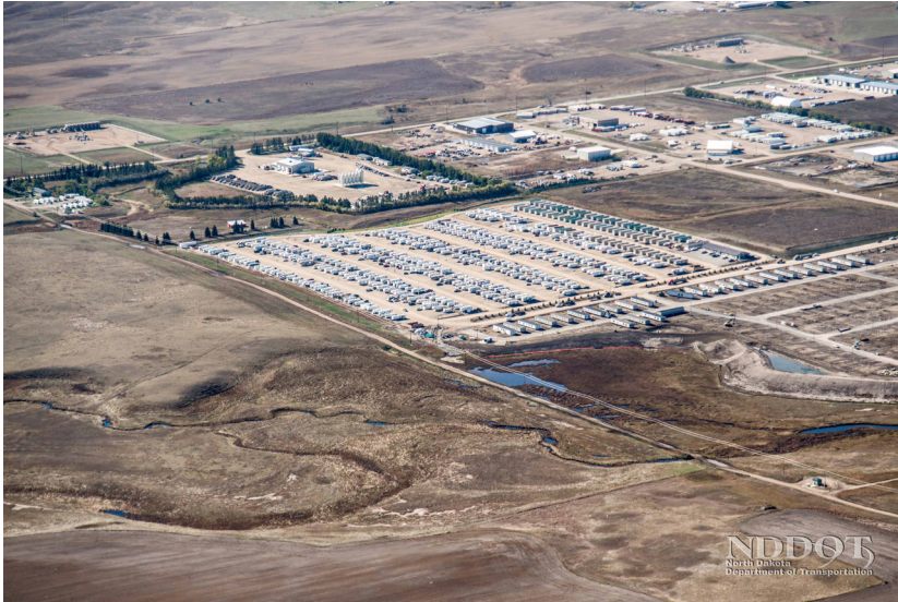
Man camp located near the US 85 Truck Reliever Route in Williston, ND.

ally drawn as one schematic unit or one multi-bunk module, but photographed as a full-scale complex assembly of a hundred or more individual units. This sharply differentiates the camp from the reservation. Though often composed of similar prefabricated homes and trailers, reservation housing is configured for radically different relationships and terms of habitation. This forms an important juncture for architectural analysis, where the logics of infrastructure and development aid merge.