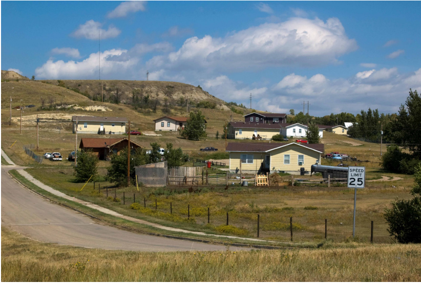
Fort Berthold Indian Reservation, ND.

and ownership, and Indian Housing Authorities are chronically underfunded. Reservation communities are consistently excluded from the financial networks at play around them and at the same time encased in those very structures.