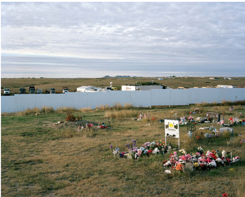
Snow Bird Cemetery, Fort Berthold Reservation, New Town, ND; from When the Landscape Is Quiet Again .

Citation: Elsa MH Mäki, "The Temporary Logics of Extraction: Tracing Architecture's (Neo)Colonial Deployment at Three Scales," in the Avery Review 31 (April 2018), http://averyreview.com/issues/31/logics-of-extraction .