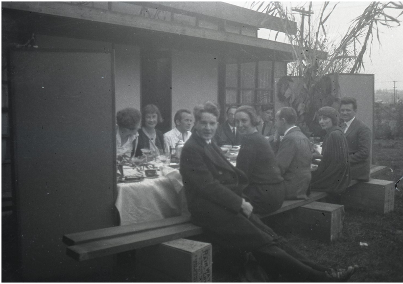
Thanksgiving at the Schindler House, 1924.

own. The house's pinwheel design was composed of four studios and a guest suite—each of the inhabitants, whether they were man or woman, husband or wife, would be granted the space to cultivate their own creative pursuits and enjoy the privileges of both solitude and community. There is an undeniable romance to the whole endeavor—something charming about the Schindlers' youthful idealism. They imagined the house to be a “cooperative dwelling,” one that would choreograph social relations in concrete and wood, making material the desire to be at once within and outside of ourselves. [2] Flattening social hierarchies while embracing the natural world, the house dissolves the material and psychic boundaries between interior and exterior, public and private. From the bare concrete walls and exposed redwood beams to the sliding panel doors and built-in furniture, Schindler envisioned an architecture that would fade quietly into the background of the inhabitants' bohemian, collective lives.