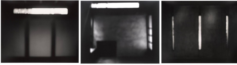
Hiroshi Sugimoto, Schindler's House , Los Angeles, 1997.

ment is created: the original gesture is interpreted by a network of dancers inside, outside, and on top of the house. This opening sequence can be read as an homage to the late choreographer Trisha Brown, whose Roof Piece first took place in Lower Manhattan in 1971 and was restaged by the High Line in 2011. With choreographic gestures transmitted through bodies, walls, and windows, the sequence highlights the literal and metaphorical porosity of Schindler's architecture as well as the way in which the house "unfolds logically and inevitably." [11]