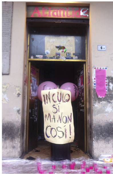
Left: “No Vat: More self-determination, less Vatican,” making the Eccentric Archive in Bologna, Summer 2015. Right: “In the ass, yes, but not like this,” the entrance to Atlantide the week of the eviction, October 2015.

toward transformation otherwise largely indistinguishable from the everyday life of transfeminist and queer self-invention and self-mythologization. The effort it takes to (re)narrate the contents of an intervention scrawled in a notebook during an assembly ten years prior, or to squint at a film negative only to see the inverted image of a lost comrade, or to remember in which year a flyer was written for an event that proved to be a turning point for a particular campaign, slowly begins to reveal a constellation of bodily and political affects, moods, and bottlenecks on the long road to becoming otherwise.