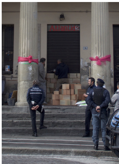
Left: “Self-management is the only solution/NO,” the interior of Atlantide the week of the eviction, October 2015. Right: Bologna, City of Walls, the municipal police brick over the entrance to Atlantide hours after the eviction, October 2015.