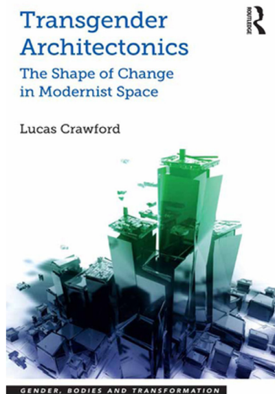
Left: Lucas Crawford, The High Line Scavenger Hunt [Calgary: University of Calgary Press, 2018]. Right: Lucas Crawford, Transgender Architectonics: The Shape of Change in Modernist Space [London: Routledge, 2016].