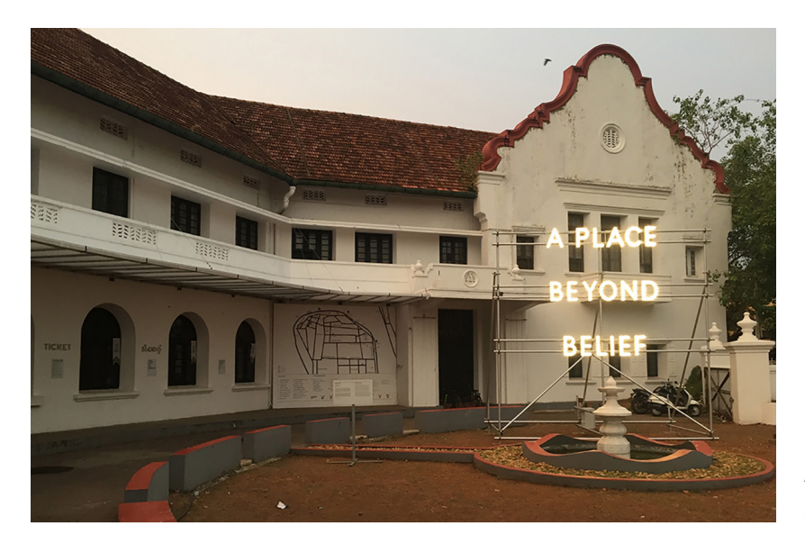
Aspinwall House, the main entrance to the Kochi-Muziris Biennale, including an installation by Nathan Coley, 2018.

Eastern, Southeast Asian, African, and Latin American nations. The exhibition provided a critical overview of the issues that are important today to artists working in such different places. Not organized under specific sub-themes, the works were grouped together with loose associations across five sites. Notable was how certain issues repeated across sites—feminism, gender, and biopolitics; literary poetics and non-western mythologies; and marginalized or disadvantaged communities, among others. Traversing between the different biennale sites, seeing art installations in spectacular old warehouse buildings, looking across waterfronts, interacting with street and city life, provided a context where particular works were further transformed in quite specific ways by the distinctive area of Fort Kochi.