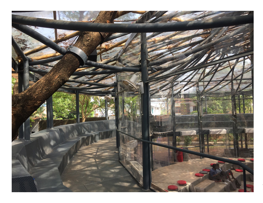
Anagram Architects, "Knowledge Laboratory" Pavilion, Carbal Yard, Kochi-Muziris Biennale, 2018.

where residents, visitors, and artists interacted in planned and informal activities. Walking around this hub and the different Biennale venues, the diverse cultural vibe of the city with temples, churches, mosques, and synagogues is palpable. So are the intense layers of colonial histories embedded in buildings built by the Dutch, Portuguese, and British. Also evident are the changing dynamics of the city with boutique hotels, home-stay guesthouses, and highend tourist shops having sprung up recently, in part spurred by the presence of the Biennale. What is the future of such a city? Is it heading in the direction of a city like Venice, a museum city, mostly for tourists and international art events?