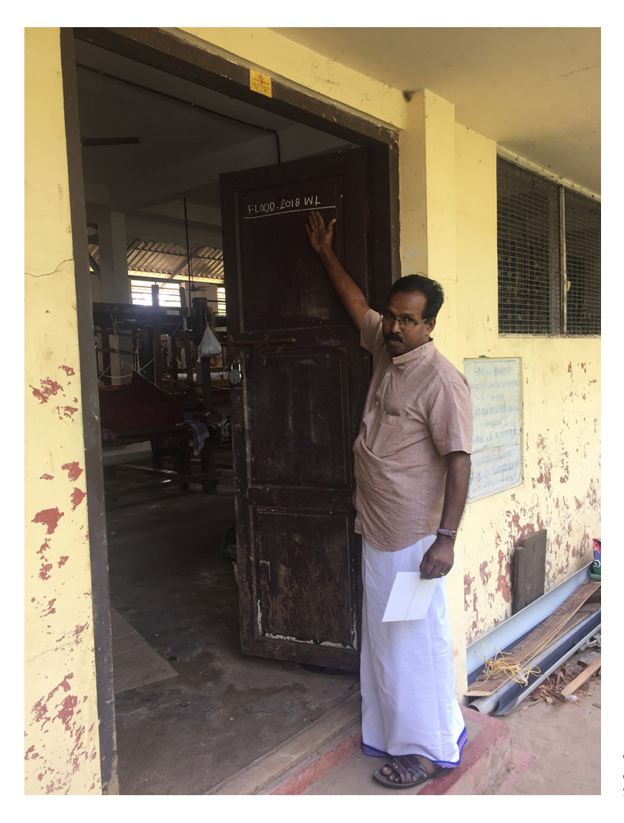
Weavers' workshop entrance with flood levels marked on the door, Chendamangalam Handloom Weavers, 2018

overflowing water just a few months before. Chedamangalam and other villages up and down the coast are crossed by networks of rivers and ocean inlets. While the heavy monsoons and varying water levels are something they have dealt with for decades, the manager said the floods in August were unimaginable. When asked what the community will do if it happens again, he only shrugged and smiled.