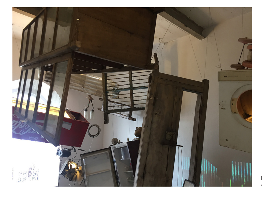
Installation view of Marzia Farhana's Ecocide and the Rise of Free Fall , Kochi-Muziris Biennale, 2018.

[9] For information on climate finance, see United Nations Climate Change website, <u>link</u>.