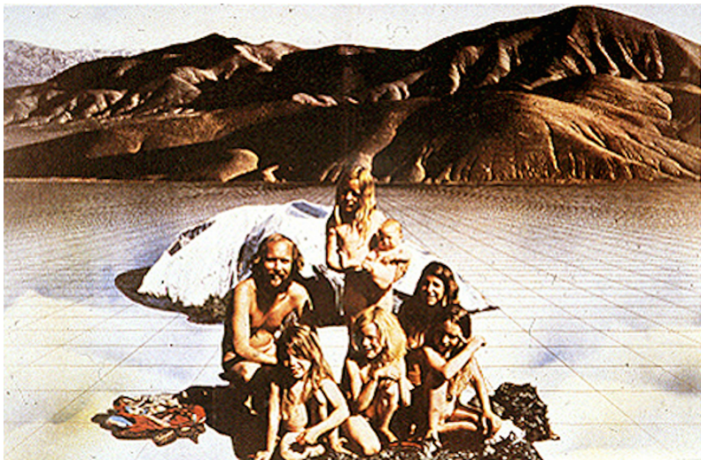
Superstudio, "Continuous Monument: An Architectural Model for Total Urbanization," 1969.