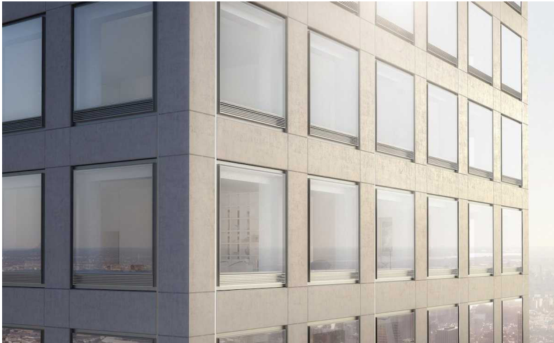
432 Park

(and Gehry's) technical and artistic ambitions.