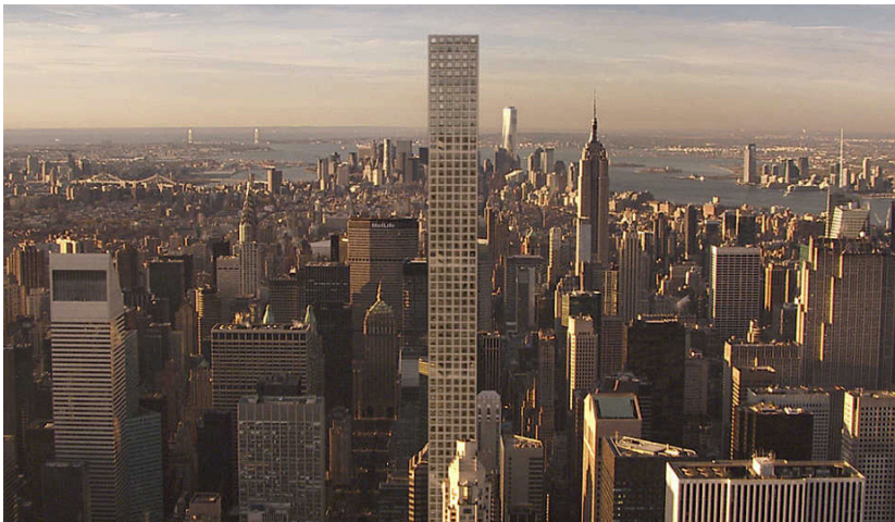
432 Park Avenue, as shown on 432parkavenue.com ,