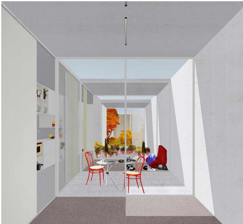
Dogma, "After Hilberseimer," 2014.