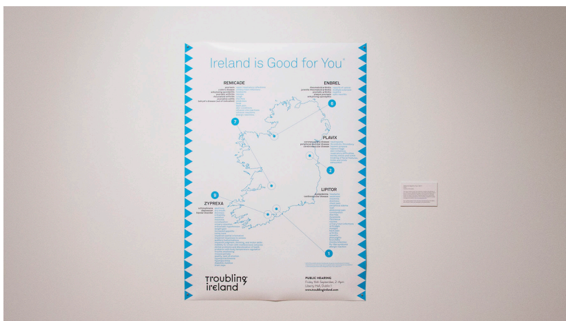
Kennedy Browne, Ireland Is Good For You*, 2011. Installed at the Krannert Art Museum, University of Illinois at Urbana-Champaign, 2018.