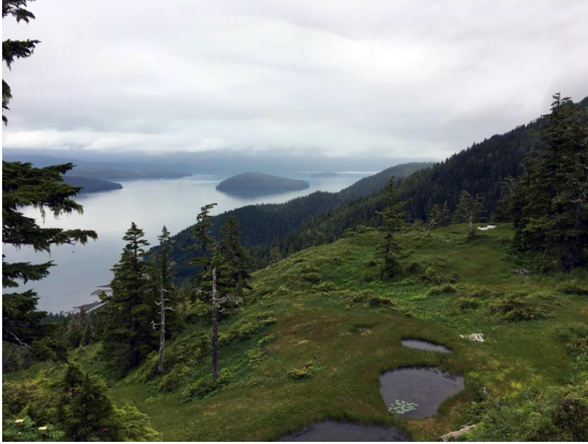
Eyak land.

commercial fishing economy. Since the 1940s, commercial fishing has been the main source of income for the community of now about 2,300 people. However, each summer this number spikes when hundreds of seasonal workers travel to Cordova to constitute a major part of the commercial fishing workforce and its connected economies. Some fishermen live in Cordova, but others travel in from their permanent homes elsewhere to use their limited-entry fishing permits and fishing vessels. Others travel to take jobs as contracted crew members on fishing boats that gillnet, seine, or tender. Others come to work at one of five seafood processing plants in town. Seasonal sub-economies grow in relation: workers build and mend fishing nets, serve food and drink, or guide the tourists who come to visit the small town built upon dispossession just underfoot.