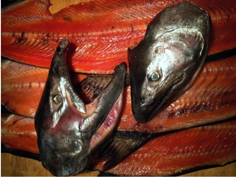
Smoked Fish Heads and Backs.

another part of the landscape while aiming to supersede First Peoples and their sovereign governments. Yet, the imperative to force territories open has always had lethal consequences. Within hyper-mobile settler capitalism, resources exit and viruses enter; mobility and entrapment co-constitute the conditions of extraction and occupation.