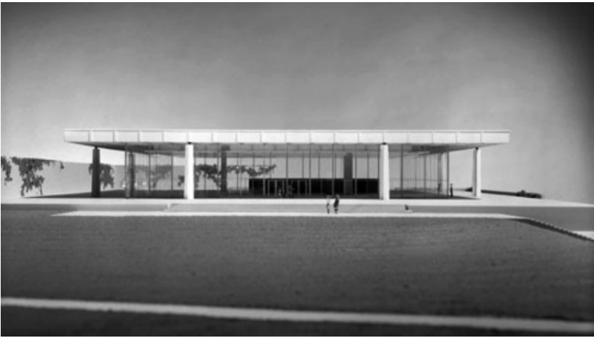
Mies van der Rohe, proposal for Santiago de Cuba headquarters.

the United States and its territories as Puerto Rican rum. At the same time, the Cuban government in partnership with global corporation Pernod Ricard, sells a different Havana Club internationally, except for in the United States and its territories. Bacardí continues to fight Cuba in courts aiming to legalize their own Havana Club trademark outside the United States.