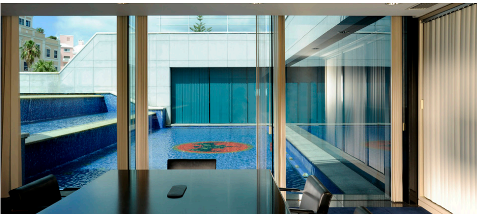
A conference room in the renovated Bacardi HQ.