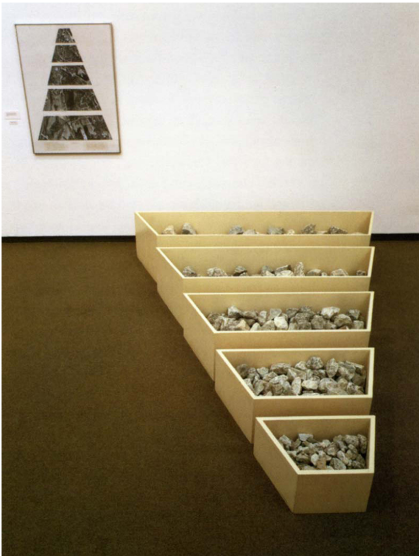
Robert Smithson, A Nonsite, Franklin, New Jersey, 1968.