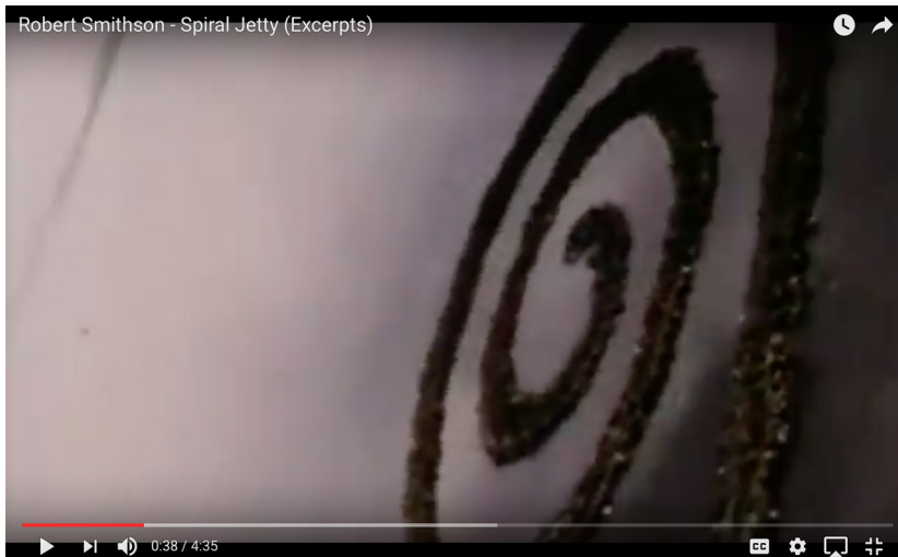
Still from Spiral Jetty . Exhibition “Traces du Sacré” at Centre Georges Pompidou, Paris. 2008.

evidence of marking the landscape; it exists as one aspect of a broadly conceived work.