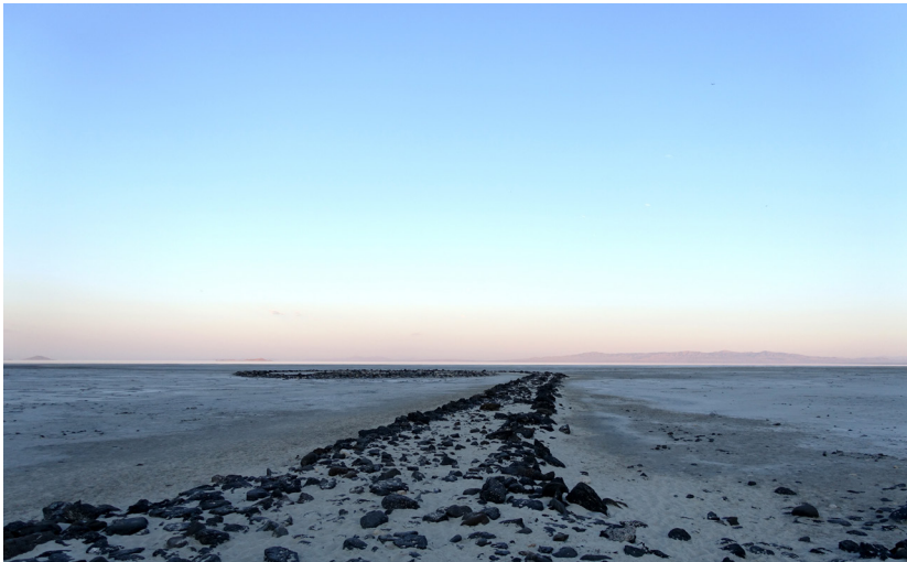
Still from Spiral Jetty . Exhibition "Traces du Sacré" at Centre Georges Pompidou, Paris. 2008.

that one goes on a fictitious trip if one decides to go to the site of the Non-Site . The 'trip' becomes invented, devised, artificial; therefore, one might call it a non-trip to a site from a Non-site." [14] Each end of the Site/Non-Site dichotomy holds a limited potential for comprehension and understanding. Both stand as abstract demarcations and displacements of material in both time and place that underline the way that knowledge about a place, a work, a landscape, or an action can be understood to be just as illusory as the efforts to represent it.