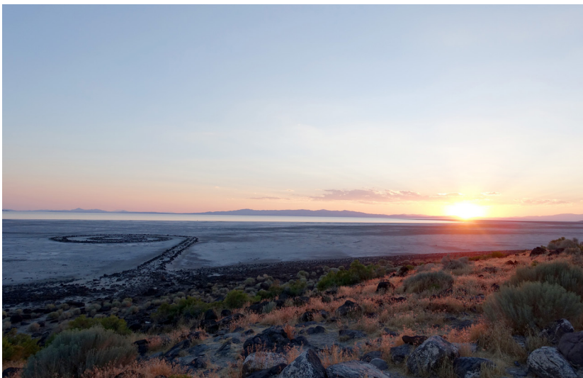
Spiral Jetty at sunset.

[1] Dia Art Foundation, "Robert Smithson, Spiral Jetty ," link . Sadly, the spike itself has been squirreled away in an archive at Stanford University.